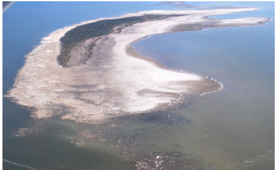
Fig. 2 Photo taken on May 5, 2010, of an island, 2.6 km long, in central Mar Chiquita lake (30°35'S, 62°43'W, in between points 2 and 5 in Fig. 1B). This was created in the late 1970s when a rising lake level inundated the low-lying scrublands up to the vegetation line shown in the photograph, making a topographic high spot an island. Since 2003, the steadily receding water level has exposed extensive mudflats, optimal flamingo breeding habitat

of Artemia and silverside. Water level data were obtained from monthly records provided by the Córdoba's provincial water resources agency. Starting in 2008, a complementary automatic recorder was installed by us. Change in water level between October and April was considered of interest, given the possibility of significant increases or decreases in water level affecting the nesting colonies. For example, flooding of nests might result from a sudden increase in lake level, or receding waters might negatively impact flightless juveniles by increasing the distance between nests and water.